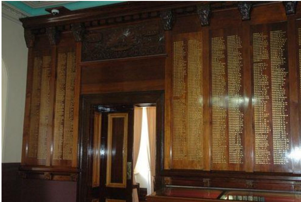
Hobart Roll of Honour