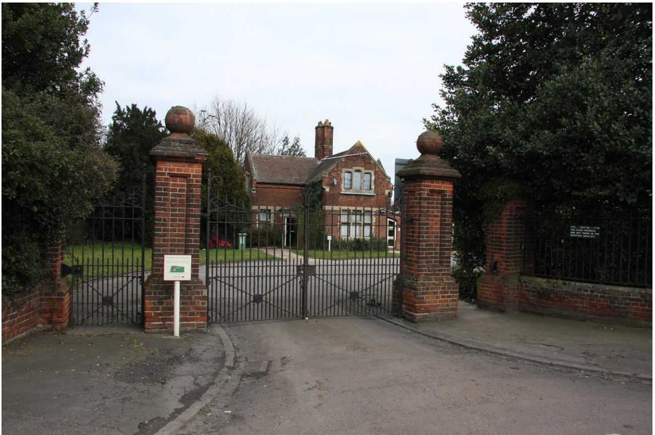
Entrance to Cambridge City Cemetery & Map (below)