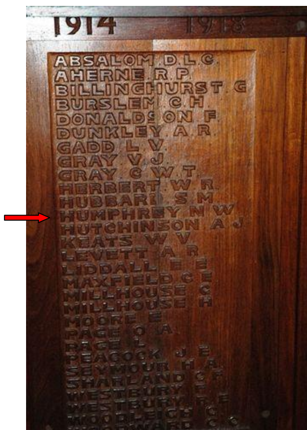
All Saints Anglican Church Honour Board, South Hobart

N. W. Humphrey is remembered on the All Saints Anglican Church Honour Board located in All Saints Anglican Church, 339 Macquarie Street, South Hobart, Tasmania.